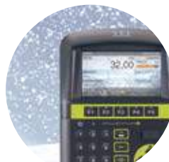
CLIMATIC TEST -40°C ÷ +80°C