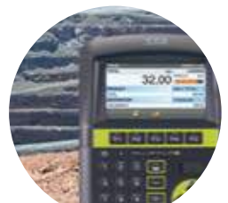
VIBRATION & SHOCK 40G