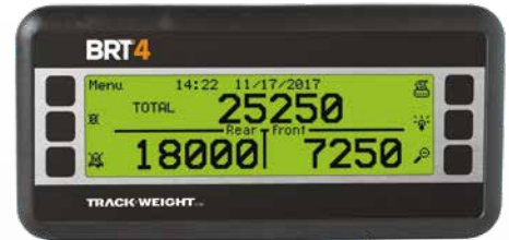
Display options set by user

Weighing is done automatically by means of sensors installed on the truck axles or air suspensions. Depending on the type of truck, the BRT monitor measures flex in the beam suspensions in real time and displays the total weight by axle group. Fitting your truck or semi-trailer with an onboard BRT 4 scale is a simple operation. You can do it yourself or have it installed by one of our specialists.